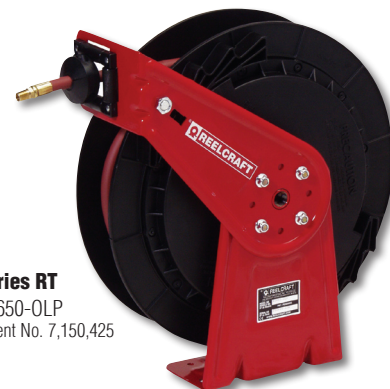
Series RT RT650-OLP Patent No. 7,150,425

LOW PRESSURE AIR/WATER REELS Maximum Temperature 150° F (65° C)