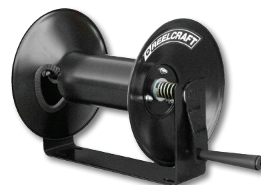
Series CU CU6100LN