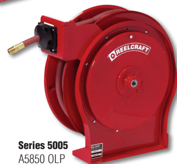
Series 5005 A5850 OLP